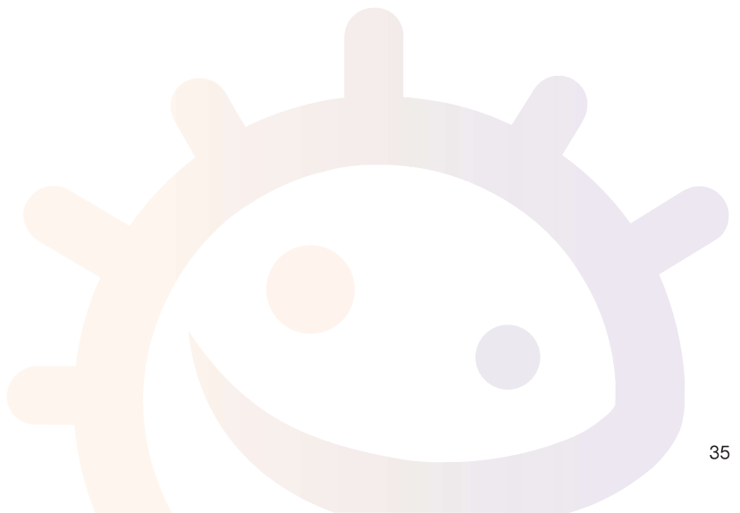
SW1 Useful Microbes and Their Properties Worksheet