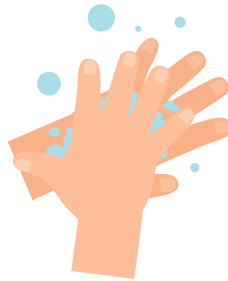
Backs of hands