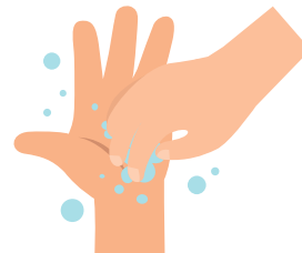
Tips of fingers

To help keep time, sing 'Happy Birthday' twice