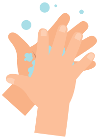
Palm to palm